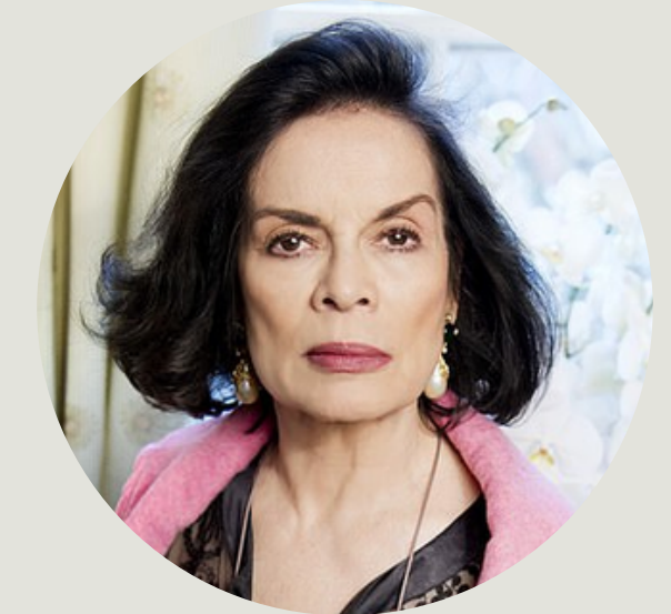
BIANCA JAGGER, SOCIAL AND HUMAN RIGHTS ACTIVISTS