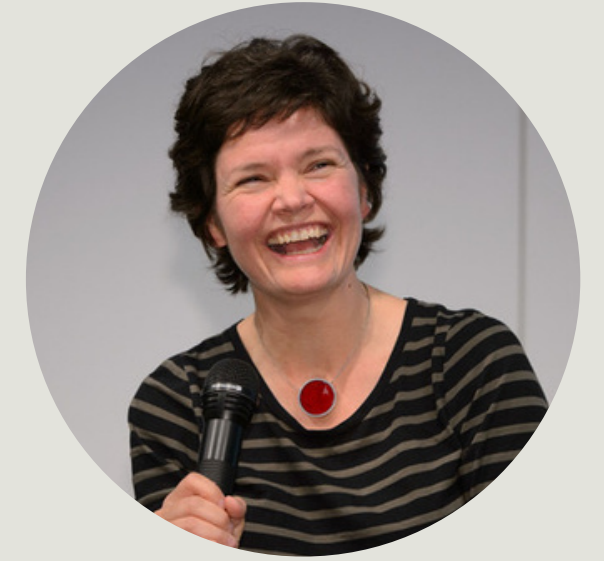
KATE RAWORTH, ECONOMIST, AND AUTHOR OF DOUGHNUT ECONOMICS