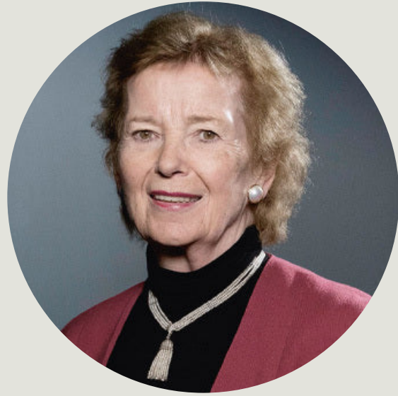
MARY ROBINSON, FORMER PRESIDENT OF IRELAND