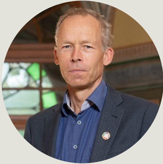
JOHAN ROCKSTRÖM, DIRECTOR, POTSDAM INSTITUTE FOR CLIMATE IMPACT RESEARCH GERMANY