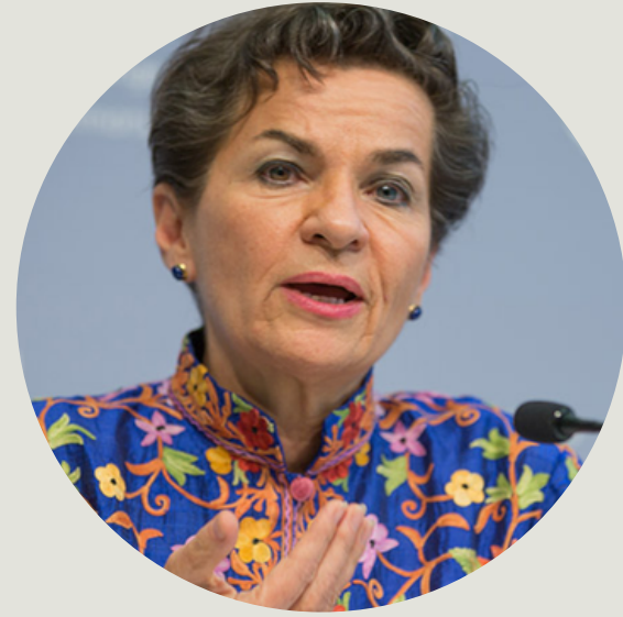
CHRISTIANA FIGUERES, FORMER EXECUTIVE SECRETARY UNFCCC