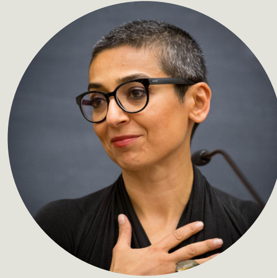
ZAINAB SALBI, ACTIVIST AND FOUNDER OF WOMEN FOR WOMEN INTERNATIONAL