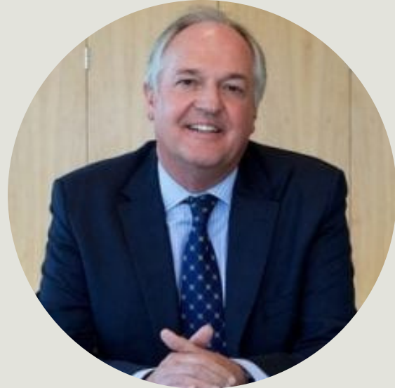
PAUL POLMAN, FORMER CEO OF UNILEVER, AUTHOR OF NET POSITIVE