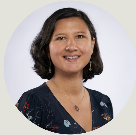
DELPHINE O., FRENCH AMBASSADOR OF GENDER EQUALITY AND GENERATION EQUALITY FORUM