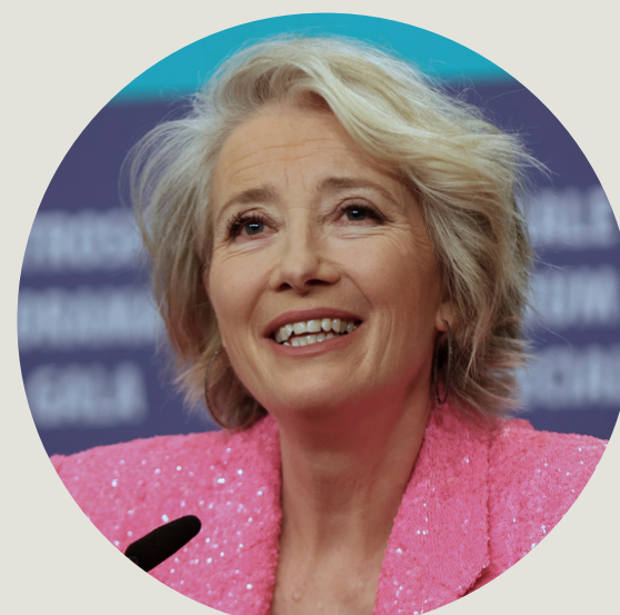
EMMA THOMPSON OBE, ACTOR AND ACTIVIST